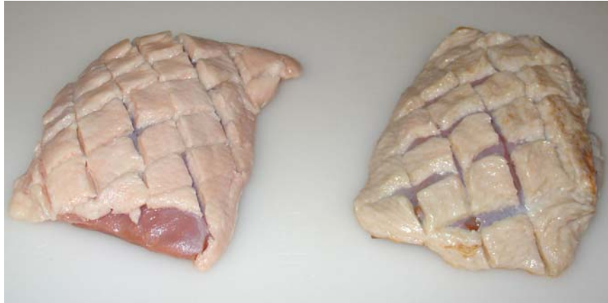
Duck Breasts Scored To Render The Fat