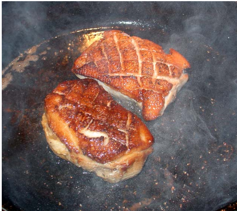
Seared Duck Breasts