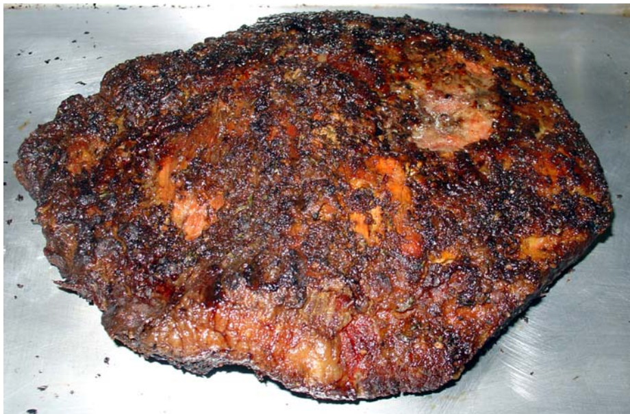
Finished Brisket After Cooking For About 9 1/2 Hours