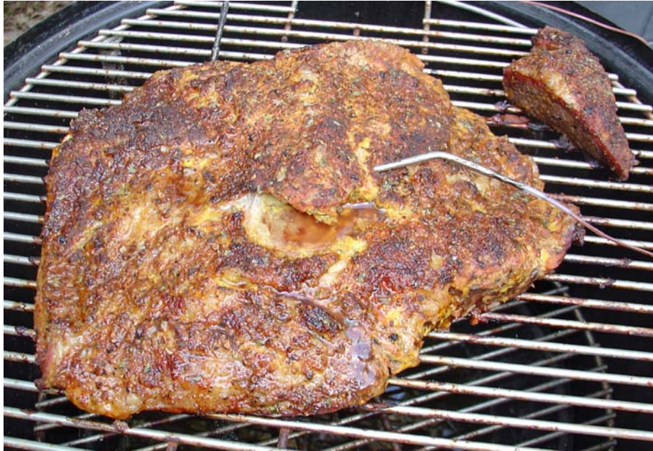
Brisket After Cooking On The Smoker For Two Hours (Notice The Sliced Portion Showing The Grain Direction)