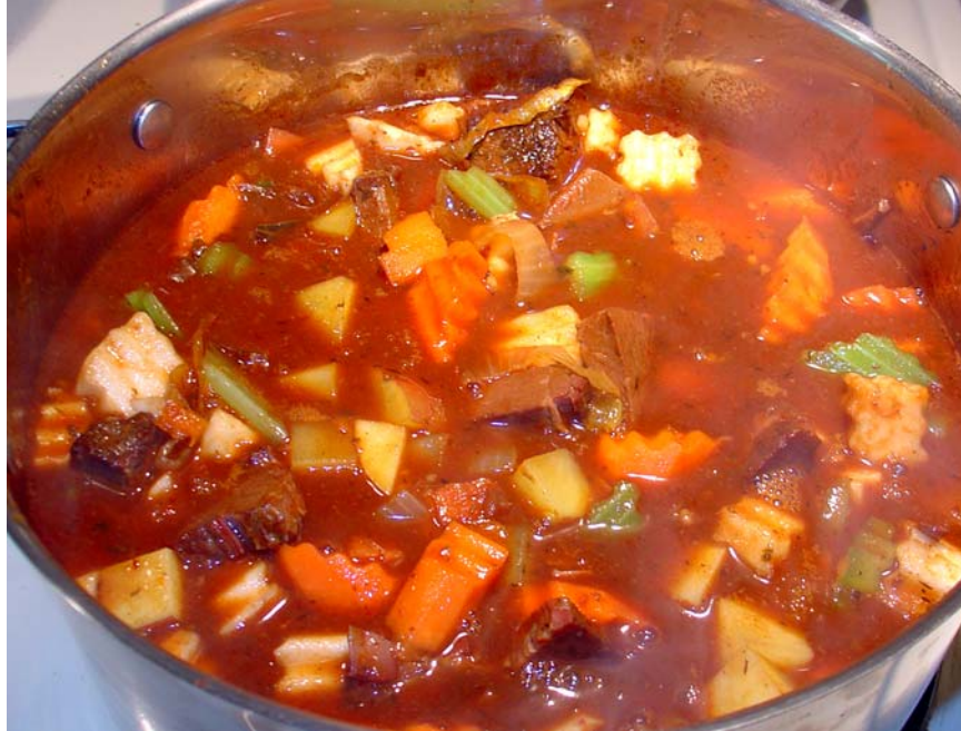
Finished Stew Ready For The Dumplings