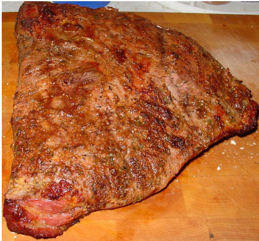
Finished Brisket Off The Smoker